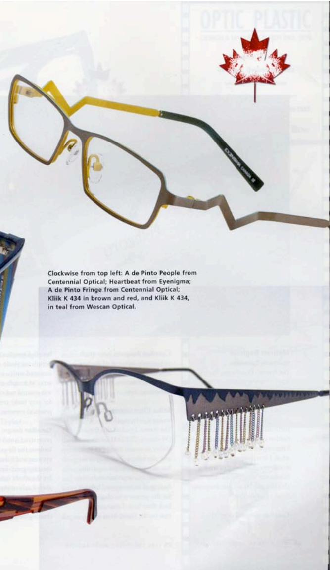
Clockwise from top left: A de Pinto People from Centennial Optical; Heartbeat from Enigma; A de Pinto Fringe from Centennial Optical; Kliik K 434 in brown and red, and Kliik K 434, in teal from Wescan Optical.