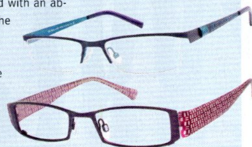
The Kliik:Denmark KL-421 (top) and the KL-423 (bottom) from Wescan.