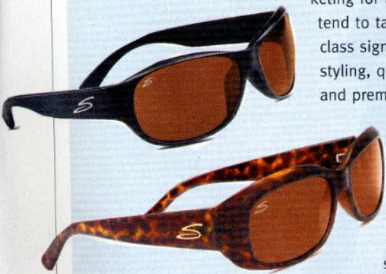
The Serengeti Bianca (top) and the Giada (bottom) from Bushnell.